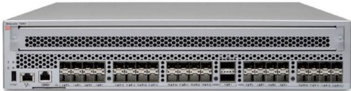
HPE SN4000B SAN Extension Switch

The HPE SN4000B configuration is a bundle including a comprehensive set of advanced services: Fabric Vision, Extension Trunking, Adaptive Rate Limiting, ISL Trunking, IPsec, Compression, Open Systems Tape Pipelining (OSTP), Fast Write, Adaptive Networking and Extended Fabric. Optional value-add licenses for Integrated Routing, FICON CUP, and Advanced FICON® Accelerator are available to address challenging extension and storage networking requirements in open system and mainframe environments. The SN4000B SAN Extension Switch is fully compatible with the entire B-Series family of FC switching platforms, delivering advanced 16 Gbit/sec fabric services end-to-end over distance and providing investment protection for hardware as well as the ability to leverage expertise and training across the data center staff.