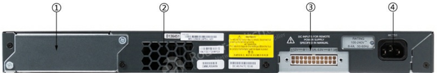
Figure 3 shows the back panel of the Cisco 2960X-48TS-L switch.

The Switch LEDs include SYST, STAT, SPEED, RPS, MAST, and STACK LEDs.