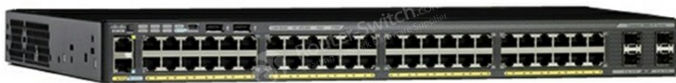
Table 1. Cisco WS-C2960X-48TS-L Specs.

Figure 1 shows the front view of the Cisco 2960X-48TS-L switch.