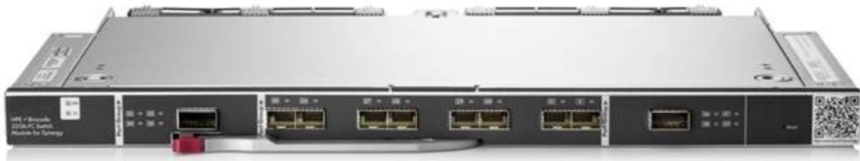
Brocade 32Gb Fibre Channel SAN Switch Module for HPE Synergy