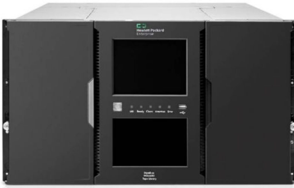
HPE StoreEver MSL6480 Tape Library

The HPE StoreEver MSL6480 Tape Library is the gold standard for mid-range tape automation, delivering best-in-class scalability, density, and performance to meet your short-term backup and disaster recovery data protection needs, as well as long-term archive requirements. Keep pace with data growth by seamlessly scaling up to 7 modules-without disrupting daily data protection. The MSL6480 also saves floor space by providing the highest tape drive density per module of any mid-range tape library. The MSL6480 Tape Library reduces the time and resources needed to achieve enterprise-class manageability, equipping you with proactive monitoring on single pane of glass control. The HPE StoreEver MSL6480 Tape Library can also provide medium sized businesses with a last line of defense solution against the threat of ransomware due to its air-gapped, offline capabilities.