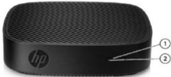
Front View Image