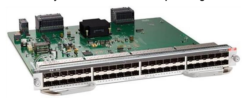
Figure 12. Cisco Catalyst 9400 Series 48-port 1 Gigabit Ethernet (SFP) Line Card (C9400-LC-48S)