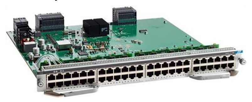
Figure 7. Cisco Catalyst 9400 Series 48-Port UPOE 10/100/1000 (RJ-45) Line Card (C9400-LC-48U)

The Catalyst 9400 Series switch UPOE line card UPOE line card supports PoE, PoE+, and Cisco UPOE to deliver 15W, 30W, or 60W to the access point. 60W of inline power can power more devices—including IP phones, IPTVs, surveillance cameras, virtual desktop clients, and many others—without having to install extra wall or ceiling circuits while taking advantage of standards-based Energy Efficient Ethernet.