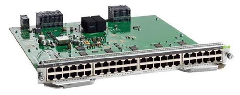
Figure 9. Cisco Catalyst 9400 Series 48-Port 10/100/1000 (RJ-45) Line Card (C9400-LC-48T)