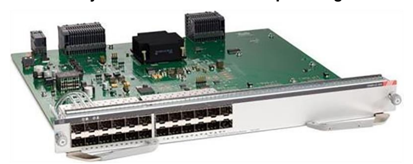
Figure 13. Cisco Catalyst 9400 Series 24-port 1 Gigabit Ethernet (SFP) Line Card (C9400-LC-24S)