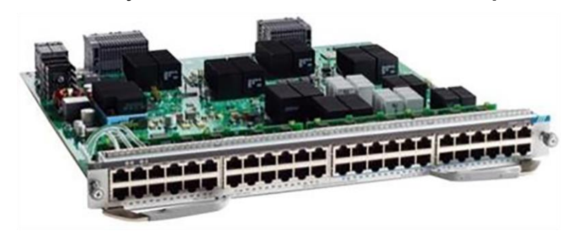
Figure 4. Cisco Catalyst 9400 Series 48-Port UPOE® Line Card (C9400-LC-48UX) with 24 Multigigabit Ports and 24 10/100/1000 Mbps Ports

The Cisco Catalyst 9400 Series 48-Port UPOE line card with 24 port Multigigabit ports and 24 10/100/1000 Mbps Ports provides the solution you need to support newer applications such as 802.11ac Wave 2 access points with your existing Ethernet access cabling. Multigigabit switch ports allow automatic negotiation of 100- Mbps, 1-Gbps, 2.5-Gbps, and 5-Gbps speeds on existing Category 5e and 6 cable, and all the way up to 10- Gbps speeds over Category 6 cabling. The Multigigabit Ethernet line card supports Power over Ethernet (PoE), PoE Plus (PoE+), and Cisco Universal PoE (Cisco UPOE) to deliver 15W, 30W, or 60W to the access point. Cisco remains the only vendor that can provide 60W to power downstream devices in a next-generation workspace. So you can power more devices—IP phones, IPTVs, surveillance cameras, virtual desktop clients, and many others—without having to install extra wall or ceiling circuits, while taking advantage of standards-based